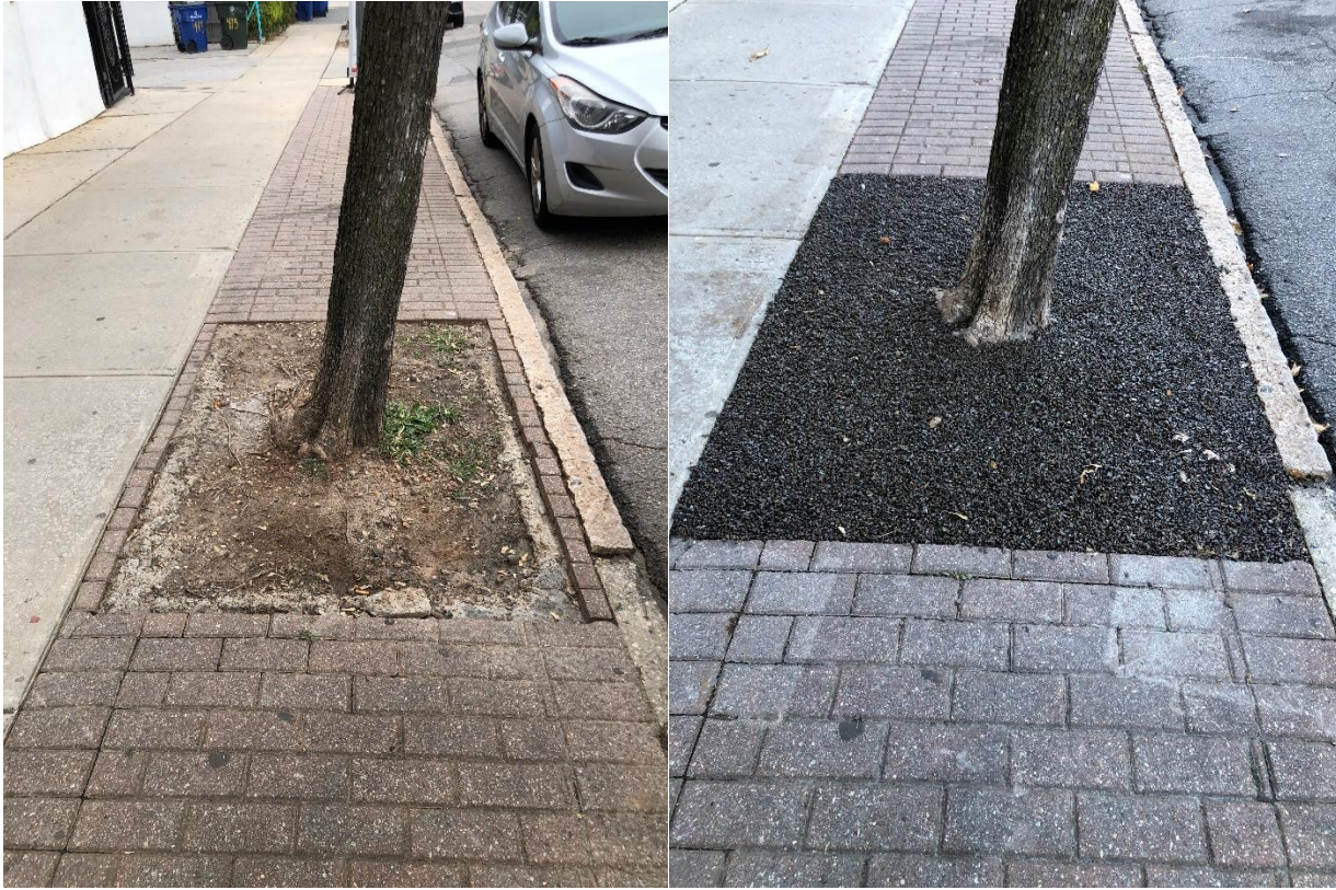
Closings and Openings

Let us know if there are other areas in Glenwood South that need attention. Contact us at gsncboard@gmail.com . We want to continue to utilize public-private partnerships to address needs in our community.